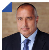
H.E. Boyko Borissov Prime Minister of the Republic of Bulgaria; rotating President, Council of the European Union