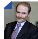
Timothy Garton Ash Professor of European Studies, Oxford University, UK