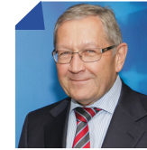
Klaus Regling Managing Director, European Stability Mechanism, Luxembourg