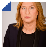
Tzipi Livni Co-leader, Zionist Union Party; Former Minister of Foreign Affairs, State of Israel