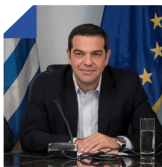
H.E. Alexis Tsipras Prime Minister of the Hellenic Republic