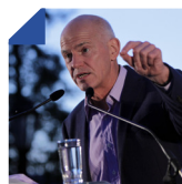
George Papandreou Prime Minister (2009-2011), Hellenic Republic