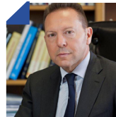
Yannis Stournaras Governor, Bank of Greece