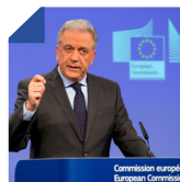
Dimitris Avramopoulos European Commissioner, Migration, Home Affairs and Citizenship