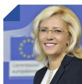
Corina Cretu European Commissioner for Regional Policy