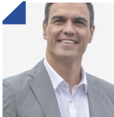
Dr. Pedro Sánchez Secretary General, PSOE (Spanish Socialists and Workers' Party) & Leader of the opposition, Spain