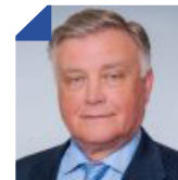
Dr. Vladimir Yakunin, Founder, Rhodes Forum; Founder, Dialogue of Civilization, Russia