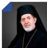
Metropolitan Archbishop Athenagoras Holy Metropolis of Mexico