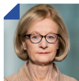
Daniele Nouy Chair of the Supervisory Board, European Central Bank, Germany