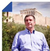
George Kaminis Mayor of Athens, Greece