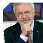
Werner Hoyer President, European Investment Bank, Luxembourg