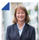
Alice P. Gast President, Imperial College London, UK