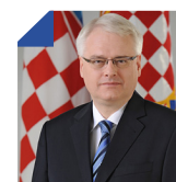
Dr. Ivo Josipović President of the Republic of Croatia 2010-2015; Professor, University of Zagreb, Croatia