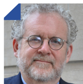
Walter Russell Mead Distinguished Fellow, Hudson Institute, USA