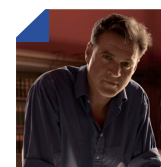
Niall Ferguson Laurence A. Tisch Professor of History, Harvard University, USA