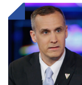
Corey Lewandowski Former Chief Political Adviser - Campaign Manager to D. J. Trump for President, Inc., USA