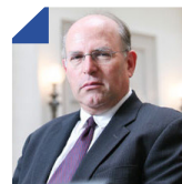
Uzi Arad Senior Fellow, The Institute for National Security Studies, Israel