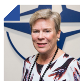
Rose Gottemoeller Deputy Secretary General, NATO, Belgium