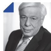
H.E. Prokopios Pavlopoulos President of the Hellenic Republic