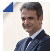
Kyriakos Mitsotakis Leader of the Opposition; President, New Democracy party, Hellenic Republic