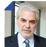
Christos Stylianides European Commissioner for Humanitarian Aid and Crisis Management