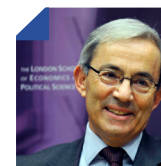
Sir Christopher Pissarides Regius Professor, London School of Economics; Professor of European Studies, University of Cyprus; Nobel Prize Winner, UK