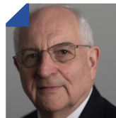
Martin Wolf Chief Economics Commentator, Financial Times, UK